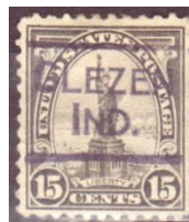
0.462454 bar A&B