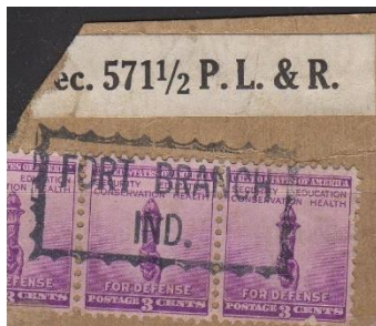
2.46 fancy box line