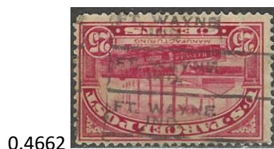
0.4662 Multi-subject device

The following are illustrations of Types with a PIC Type Note in the listings.