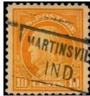
4.46(13/44)3 and a clear copy