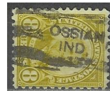
7.4662 single-line roller