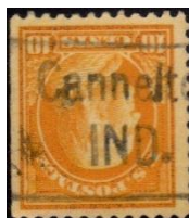
2.66 and sim 2.66 CON