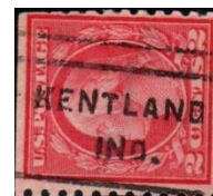
7.4643 dbl-line roller