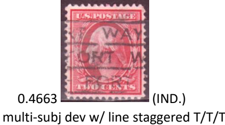
0.4663 multi-subj dev w/ line staggered T/T/T