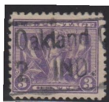
1.5544 integral Paid.