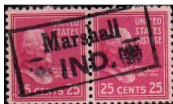
2.64(5/9) and a later example