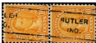
Same DLR multi subj