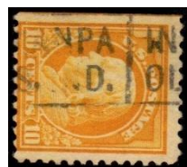
NPA error in device