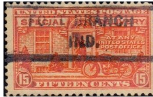
4.4643 long-box roller