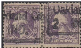
2.66 box cancel with 2 in the device