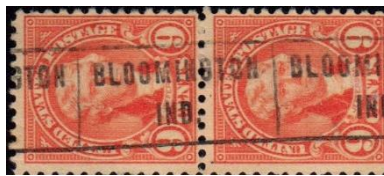
4.4613 and a variety