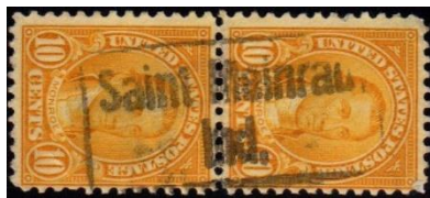
2.56 heavy impr