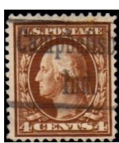
2.5214 and a second example