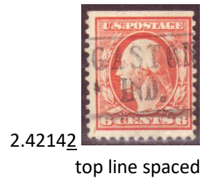
2.42142 top line spaced