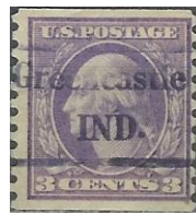
4.6253 and a pretty one