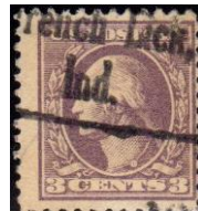
2.525 and another town